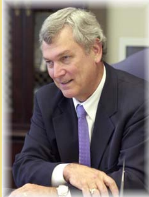
JERRY HILL STATE ATTORNEY

POLK COUNTY COURTHOUSE 255 NORTH BROADWAY 2ND FLOOR BARTOW, FL 33830